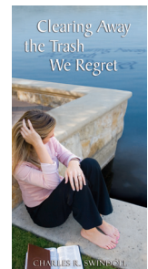
Clearing Away the Trash We Regret by Charles R. Swindoll booklet